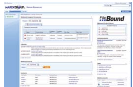
Sample SharePoint HR Portal with FileBound Integration