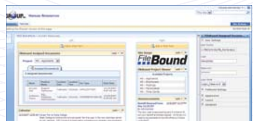
Four Easy-to-Configure Web Parts